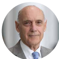
Tom de Bruijn

Minister for Foreign Trade and Development Cooperation