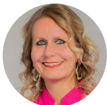
Mascha Baak Consul General of the Kingdom of the Netherlands in Milan